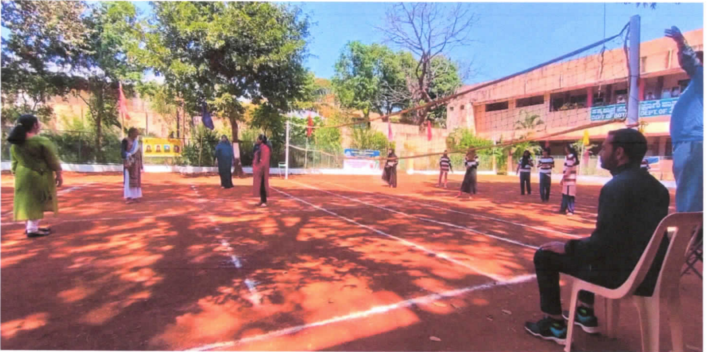
SPORTS(INDOOR & OUTDOOR)