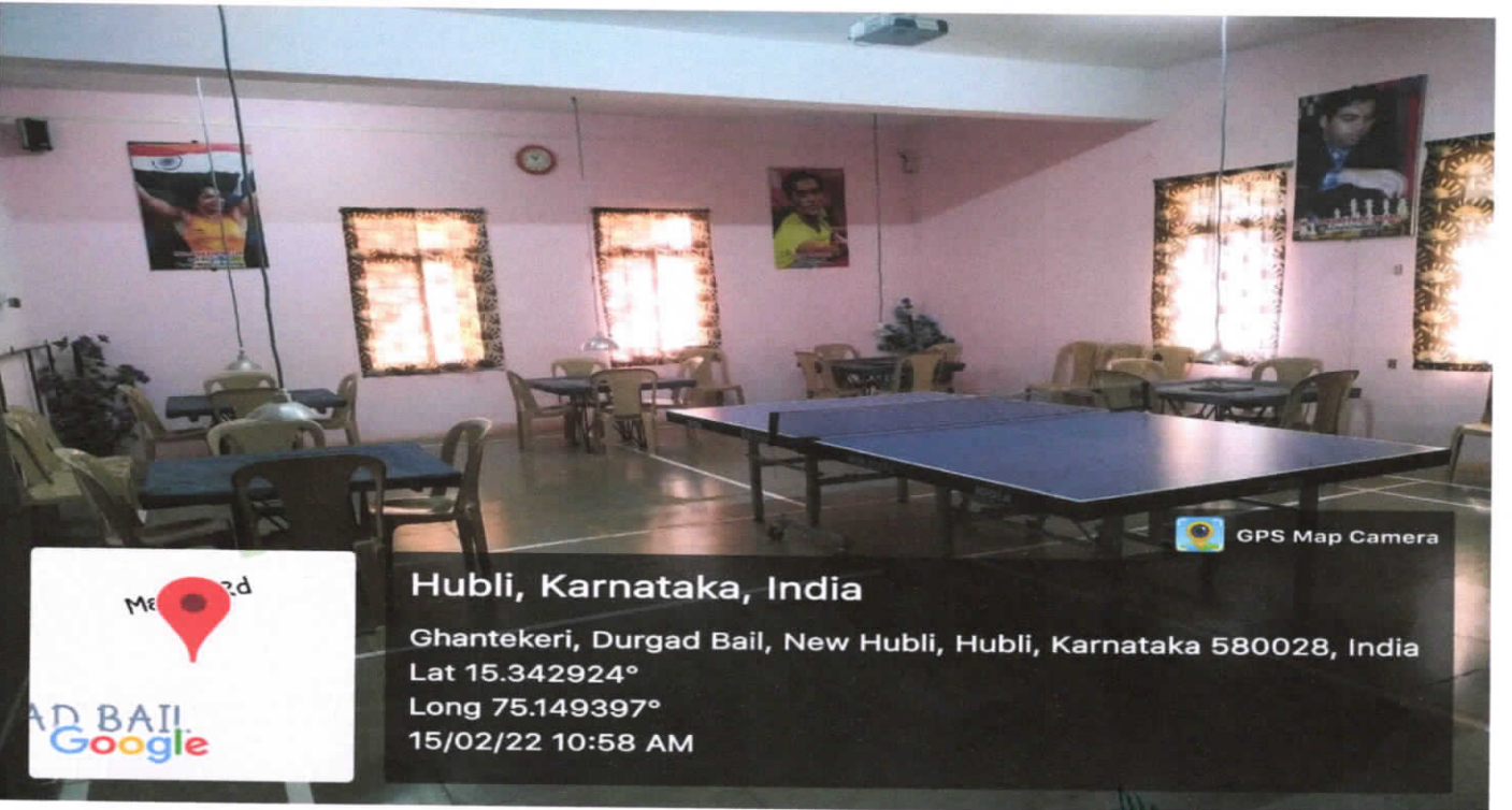
PHYSICAL EDUCATION – GYMNASIUM

Ghantekeri, Durgad Bail, New Hubli, Hubli, Karnataka 580028, India Lat 15.342915° Long 75.149371° 15/02/22 10:57 AM